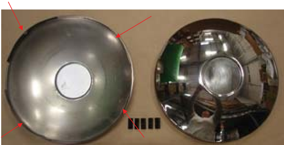
P/N 22582-4I – has 4 Notches – Arrows are pointing at each notch

When we talk about notches in a front wheel – we are counting the open spaces in the wheel. I have used arrows to show you how we determined that this is a 4 notch. On this wheel we would use p/n 22582-4I, because it has (4) open spaces for the moon to fit into.