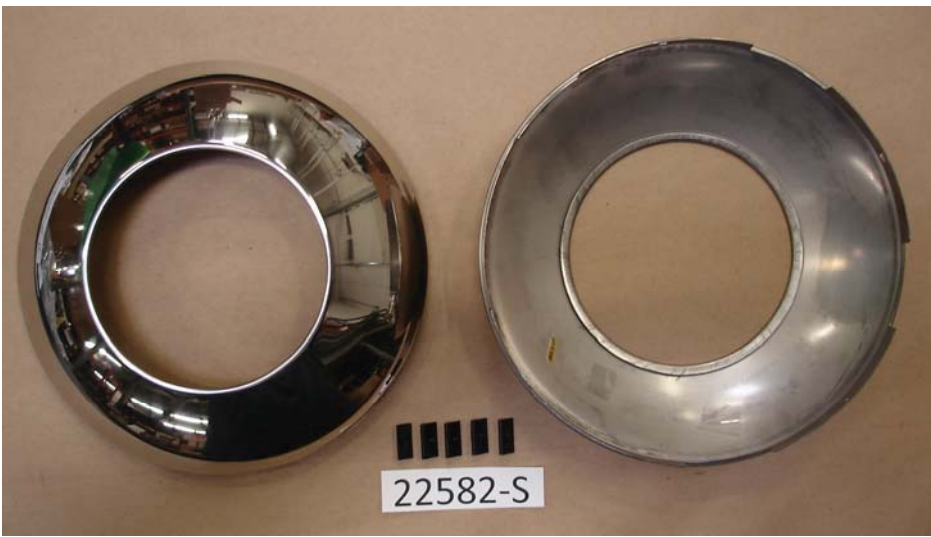
P/N 22582-S – has 5 Notches –