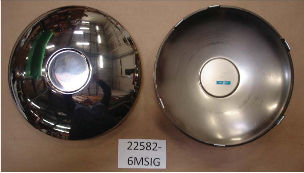
P/N 22582-6MSIG – has 6 Notches